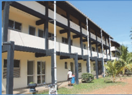
The Sarvodaya Centre where the Teacher Training will take place from 17-19

The Training Days are seen as a huge step forward for our Preschool Teachers, and our OSL team will monitor afterwards the effect that the training has had, by visiting preschools.