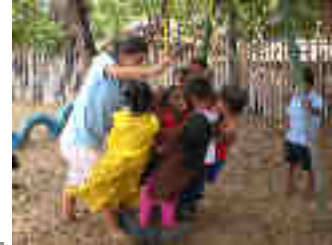
Children enjoying a swing donated through our Gift Catalogue