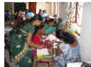
Teachers busy on their training

OST pays the wages of 33 playgroup teachers in Batticaloa and Trincomalee. The local town councils have a limited budget from the government which does not extend to paying the wages of Playgroup teachers. The wages range from £15 a month to £25 a month for more experienced teachers. At the moment these wages are being paid from OST central funds and we are looking for individuals who may like to sponsor the wages of a teacher. Your money will go directly to the teacher who in turn is able to provide for her family. OST had a training day for all teachers on our last day in Batticaloa. The teachers commented on how valued they feel and were in tears when we left. " Thank you OST for helping me feed my family."