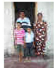
A family from the Kalladay sponsorship scheme.

Thank you for taking the time to read our newsletter. We hope you continue to support our work in making a difference to the lives of the people of Sri Lanka. Donations made payable to "Ocean Stars Trust" can be sent to us at the above address. We will continue to keep you updated with our work.