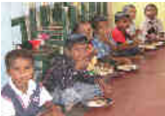
Children from Mandoor Playgroup enjoy lunch provided by Ocean Stars.